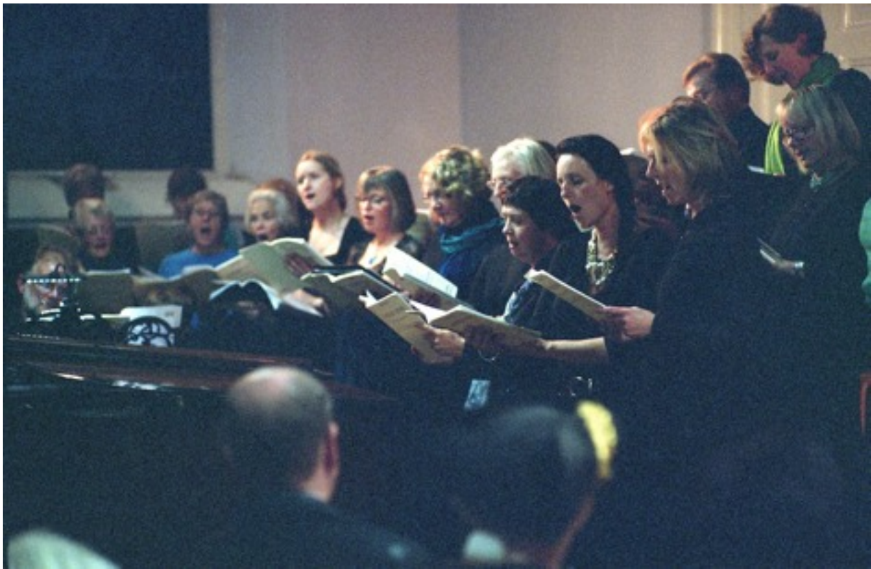
Brighton Voices Choir